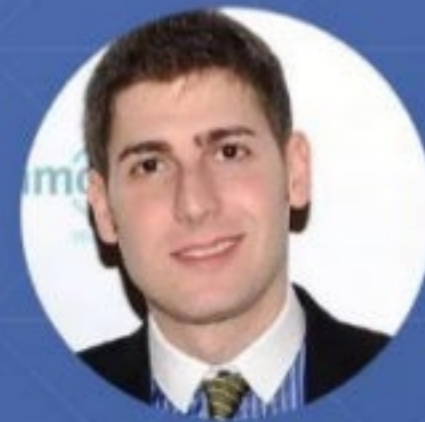
Eduardo Saverin CFO, Thefacebook.com Cambridge, MA 02138

If you are interested in our online marketing services, please contact us via e-mail. We will help expose your product, service or recruitment effort to thousands of college students, alumni, faculty and staff throughout the country.